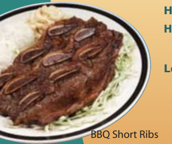
BBQ Short Ribs