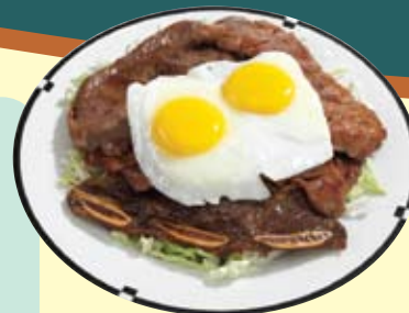
Atkin's BBQ Plate

Hawaiian BBQ chicken, Hawaiian BBQ beef and 1 egg.