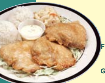
Fried Mahi Mahi

A mixed bag of exotic spices cooked with potato, carrots and onion. Not too spicy, but tastes "ono" (delicious).